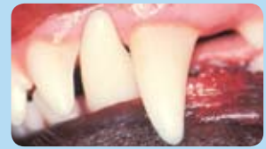
(a) Healthy mouth

Unfortunately once a tooth becomes loose, the problem has usually progressed too far to save that tooth. However if gum problems are identified at an earlier stage, a combination of a Scale and Polish and ongoing Home Care can make a real difference to your pet's oral health (and also their breath!). Please contact us today for further details!