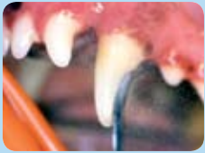
Removing the calculus using an ultrasonic scaler, followed by polishing the teeth is a very effective form of treatment

A healthy mouth typically has bright white teeth and shrimp pink (or sometimes pigmented) gums. However plaque bacteria are constantly accumulating on the surface of their teeth and will, in time, lead to inflammation of the gums – a condition called gingivitis . Affected gums are more reddened in appearance, and these changes may also be associated with localised mineralisation of the plaque to form calculus (tartar) – see picture (b).