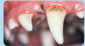
(b) Gingivitis – with early calculus